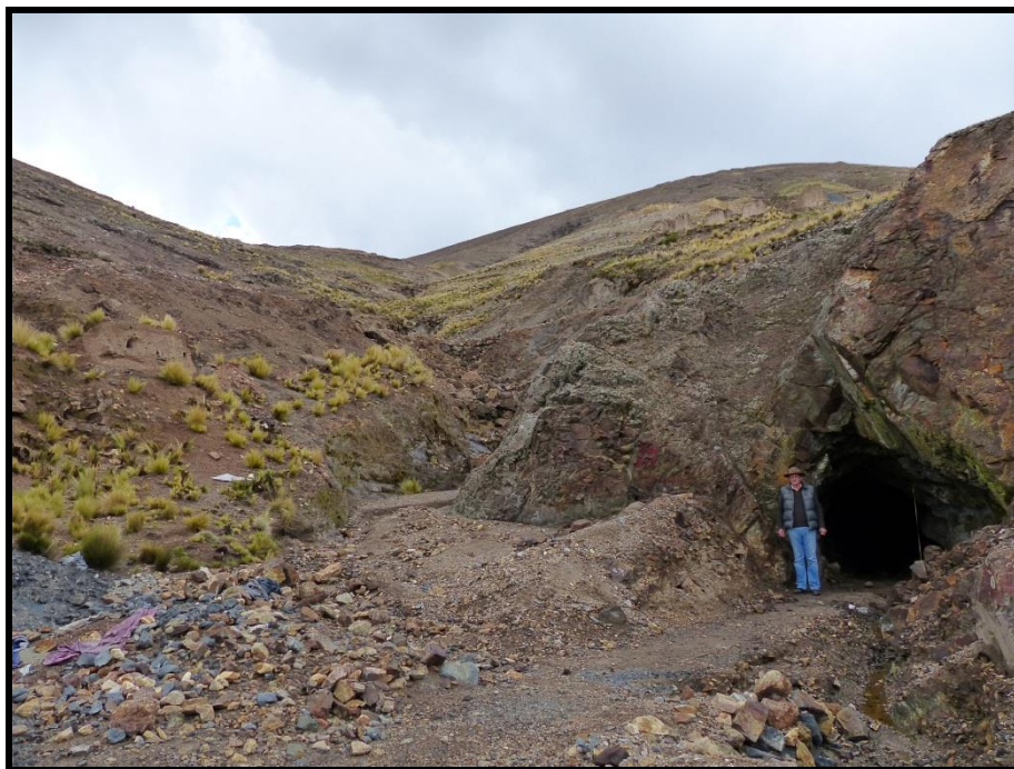
Figure 4 – SAT MD John Kelly at the Entrance to the Callaperia Adit No 1

"While project development is our main priority, SAT is also continuing to undertake exploration works to enhance future production efforts and the sampling program that will commence very shortly at San Pedrito is an important value-adding undertaking. Testing of existing stockpiles will add significant value to our first proposed production project and we look forward to reporting on the results shortly."