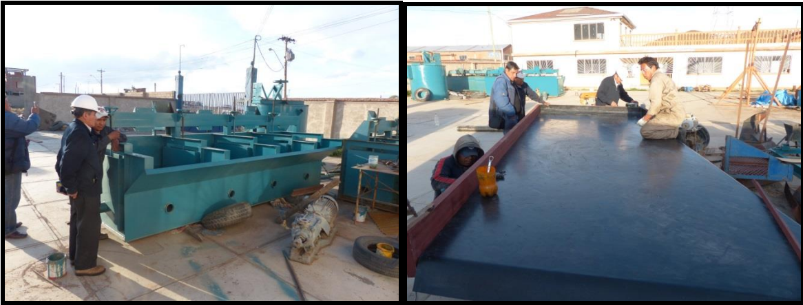
Figure 2 – The FAVAL Foundry in Oruro. Left, a Completed Bank of Flotation Cells. Right, a Shaking Table in Construction (items and construction not related to SAT’s project)