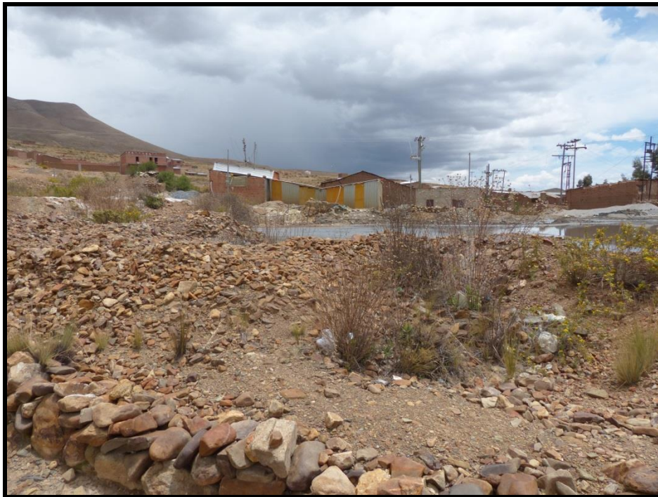
Figure 3 – Proposed Toll Treatment Plant Site Showing the Existing Small Treatment Plant and Adjacent Power Line

Victory Mines Limited ABN 39 151 900 855