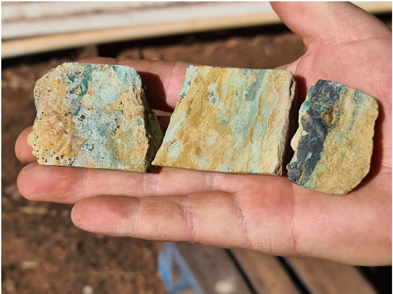
Figure 1: drill core showing the cross-cutting nature of the copper mineralisation

The structure in the recovered drill core can be traced in outcrop and in gravity images through other areas where significant copper anomalism exists.