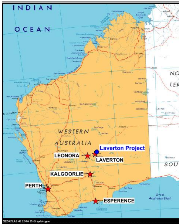
Figure 2 – Laverton Project Location

Phase 3 of the exploration strategy will be a RAB drilling programme to drill test the targets generated from the first 2 phases of exploration.